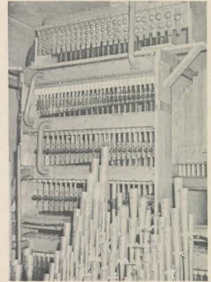
Percussion in solo chamber. Sleigh Bells, Glockenspiel, Chrysoglott, Chimes (in background)