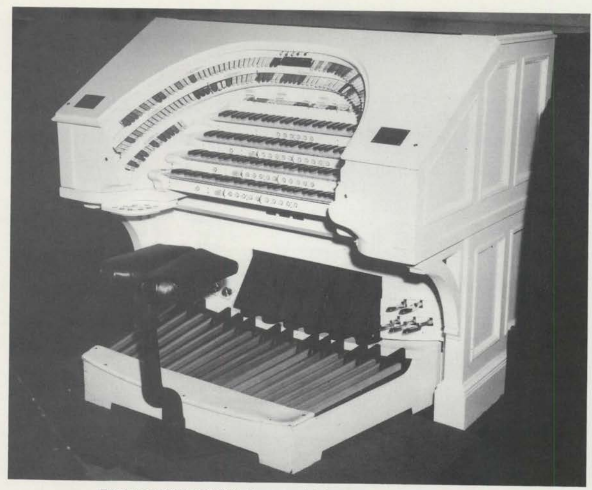
The Chicago Theatre 4/29 Wurlitzer, console is located at left side of orchestra pit.