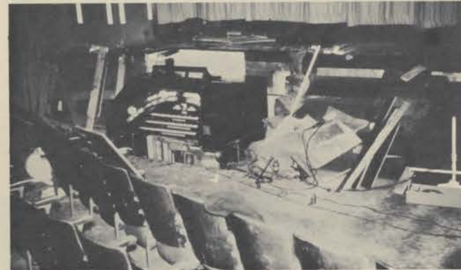
'Looks Good From Here'