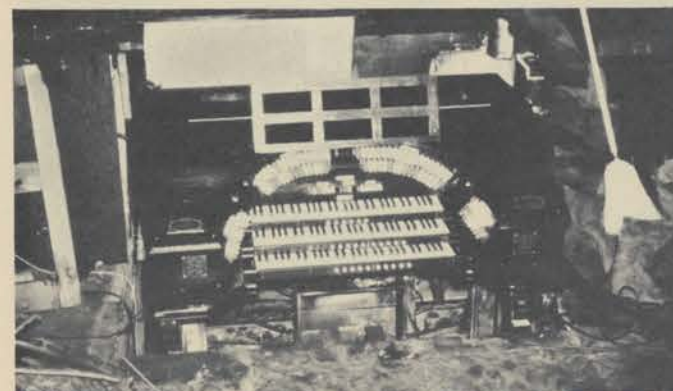
Granada - Cleveland, Ohio - 'A Front View' - Left Panel - Right and Left Revolve - Right Panel - Up and down Controls.