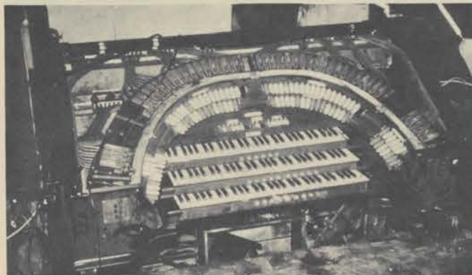
Wurlitzer 235 - 'Delightful'