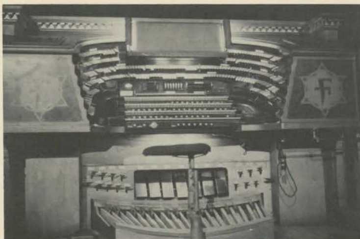
Console of the Fox ,Atlanta, 4/42 Moller.