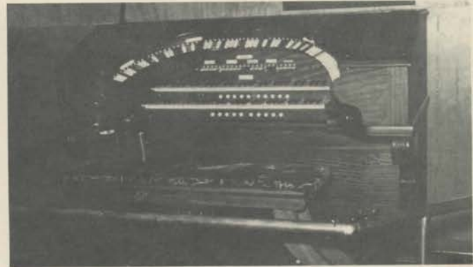
The original two manual console of the Pizza Wurlitzer.