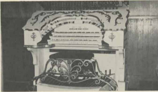
The new 3 manual console in the Pizza Joynt, San Lorenzo, Calif. Note unenclosed sleigh bells in back of console.