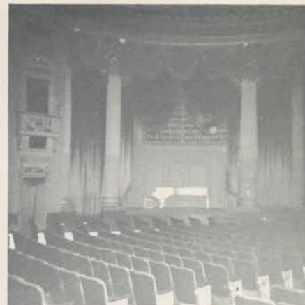
Solo (Left Chamber)

were water damaged again in the early forties and still again in the fifties, with the result that the organ is no longer playable, because of both water and pipe damage. Various individuals have worked on the organ in recent years, but too much work needs to be done to make it practicable. The Capitol manager extends a warm welcome to anyone wishing to see the organ, and has indicated a desire to sell the instrument.