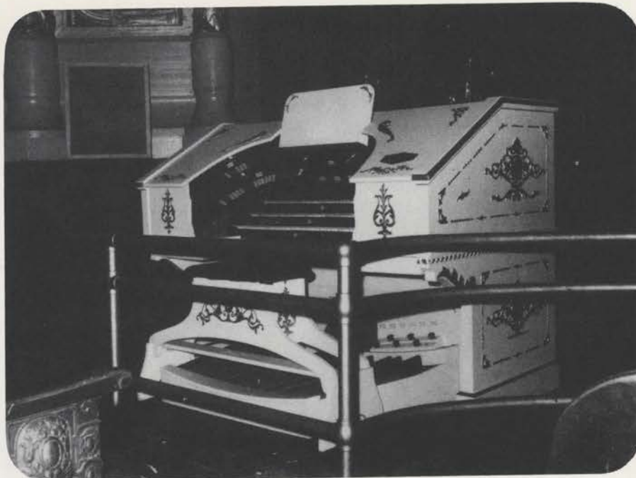
Restored Morton console in the Temple theatre.