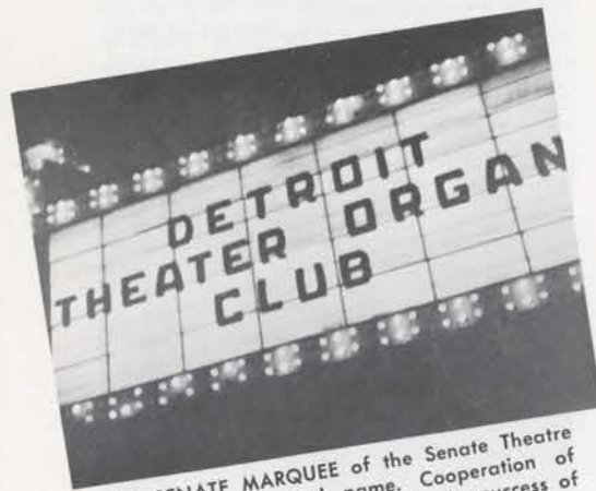
THE SENATE MARQUEE of the Senate Theatre proclaims this proud name. Cooperation of DTOC proved a major factor in the success of the 1967 ATOE convention.