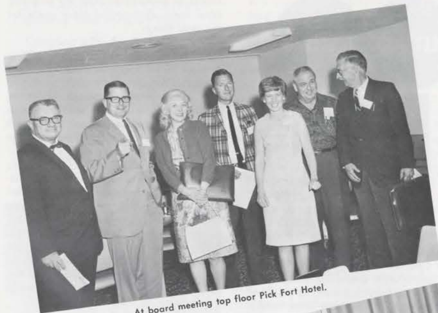
At board meeting top floor Pick Fort Hotel.