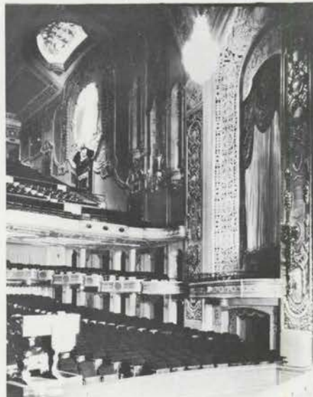
THE MICHIGAN AUDITORIUM as it appeared in 1927.

The Theatre, built in 1926 at a reported cost of $6,000,000, is equipped to handle every type of film presenta-